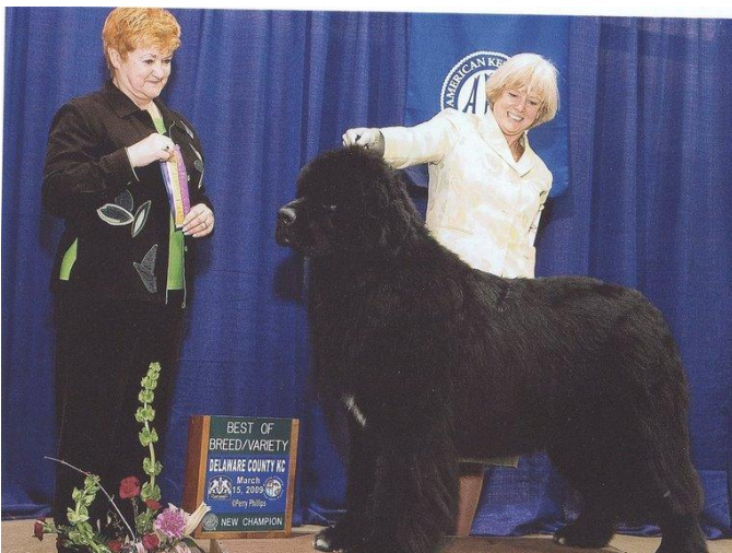
Ch Old Bay's "Potter as in Harry"