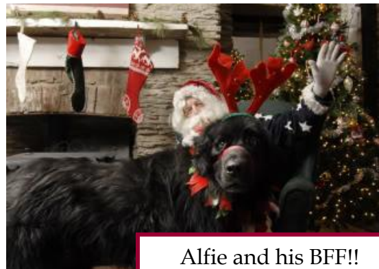
Alfie and his BFF!!

Alfie is very well behaved and makes friends wherever he goes. He is frequently seen at Harpers Ferry National Park where he has been a re-enactor playing the role of Seaman the Newf who accompanied Lewis & Clark on their Voyage of Discovery (Lewis visited Harpers Ferry twice to procure provisions for the journey.) Alfie's housemates are Ace, a 10-year-old Lab-mix, and Rikki, 16-1/2 year old Wooly Husky, and often a foster dog (Currently Lucy, the 2 year old English Foxhound). His favorite activities are snacking, going for a stroll, sleeping, and squeaking his stuffed frog and rubber chicken. *Alternative Listing/Indefinite Listing Privilege (PAL/ILP) For more information about this program, follow this link to the American Kennel Club's website: http://www.akc.org/reg/ilpex.cfm